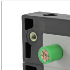
Also available with threaded bushings.