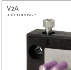
V2A anti-corrosive Also available with stainless steel screws (V2A).