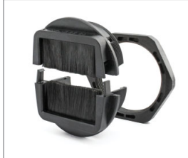
Round version with M50 thread for locknut or snap-in mounting.