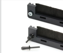
Screw mounting or mounting via expanding rivets possible.