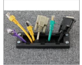
... as well as for energy and building technology.