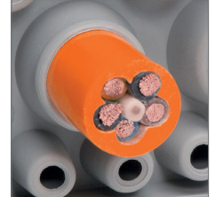
Conical shape on back provides additional sealing and strain relief