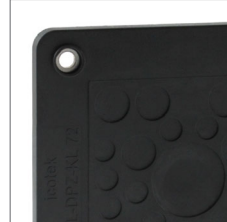
Also available in black.