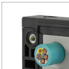
Also available with threaded bushings.