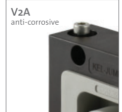
Also available with stainless steel screws (V2A).