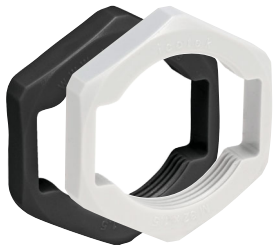
Type KGM: SUB-D9, PB, SUB-D25