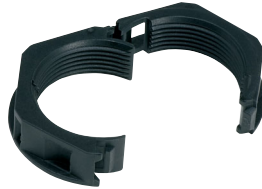
Type GMT: Split locknut