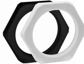
Type KGM: Standard nut, plastic