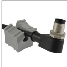
Slit KT grommets