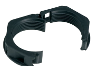
Type GMT: Split locknut, p. 209

KGM-SUB-D25 fits SUB-D25 connectors (Required wall cut-out: Ø 50 - 54 mm, PU:10) ■ Order No. 45110