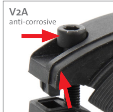
Injected elastomer gasket