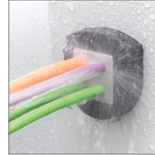
Certified protection class IP65/IP66/IP67/IP68